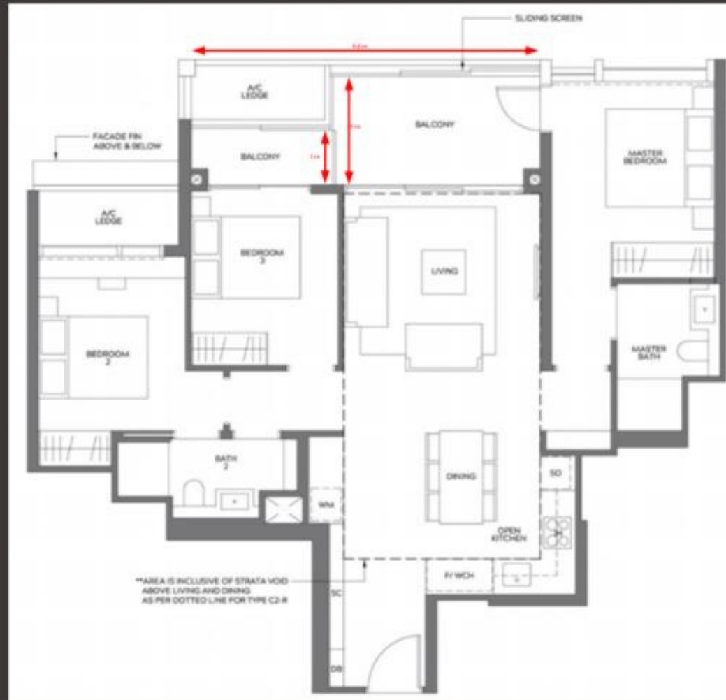
Alternative option for store layout