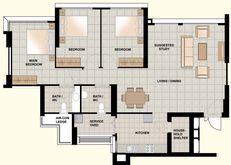
TYPICAL 5-ROOM FLOOR PLAN APPROX. FLOOR AREA 114 sqm (Inclusive of Internal Floor Area 110 sqm and Air-Con Ledge)