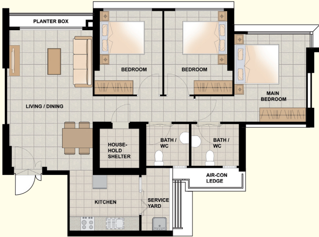
TYPICAL 4-ROOM (WITH PLANTER) FLOOR PLAN APPROX. FLOOR AREA 96 sqm (Inclusive of Internal Floor Area 92 sqm and Air-Con Ledge)