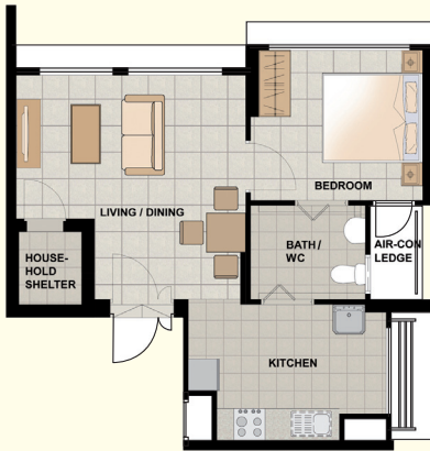
TYPICAL 2-ROOM FLOOR PLAN APPROX. FLOOR AREA 47 sqm (Inclusive of Internal Floor Area 45 sqm and Air-Con Ledge)