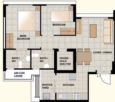
TYPICAL 3-ROOM FLOOR PLAN APPROX. FLOOR AREA 63 sqm (Inclusive of Internal Floor Area 60 sqm and Air-Con Ledge)